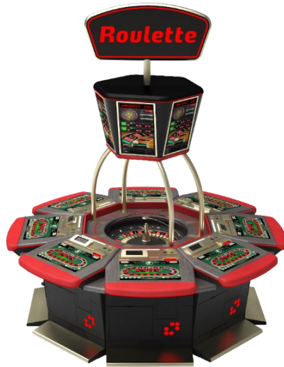
Spintec – Automated Roulette