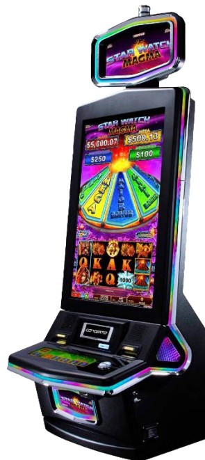
Konami – Concerto Stack 4k Cabinet, 4 levels SAP “Star Watch Magma”

The slots sector is always key for Konami in Asia. This year, the gaming machine specialist Konami Australia Pty Ltd will highlight its Link Progressive and SAP jackpot series at stand A429. One of the highlights will be “Ba Fang Jin Bao” 4 levels Link Progressive. It is available in Concerto Stack cabinet with 4K Graphics. Two games will soon be available in Macau market in 2019, namely “Fortune Totems” and “Abundant Fortune”. The 3 levels Link Progressive or SAP games “Golden Blocks Sun Da Seng” and “Golden Blocks Princess Majesty” and 4 levels SAP games “Star Watch Magma” add more irresistible fun that players are eager for.