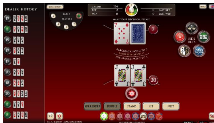
Spintec – New Karma Virtual Blackjack

Spintec the official nominee of Best Industry Supplier of 2019 G2E Asia Awards, will highlight its Karma Virtual Blackjack, a new game that will be presented in Asia for the first time, the game experience is as close to live as possible. Furthermore, it comes with up to five additional side bets, namely Hot 33, Royal Alliance, Dealer Crush, Suited Twins and Poker Hunt that make the game even more interesting and fun to play. It is believed that the game with a virtual dealer on the big screen will have players rush to play which all means longer gaming sessions and higher revenues for the operators.