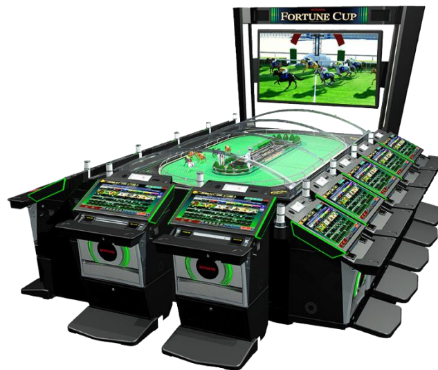
Konami – Fortune Cup Horse Racing Machine

Konami will also introduce Concerto Stack cabinet. It offers a 43" HD cinematic display, KP3+ Platform, high impact visual interaction and custom portrait-oriented game formats. In addition to the latest slot innovations, after the debut of Fortune Cup the horse racing machine in Macau this March, this highly praised game that was launched in South East Asia will also be unveiled in the show. Players can place their bets through touchscreen stations with race stats, horse odds, and comprehensive bet options for win, place, and quinella. This product is officially nominated as Best Electronic Gaming Solution (Slots and ETGs) of 2019 G2E Asia Awards.