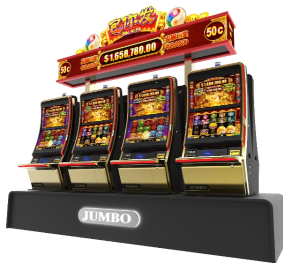
Jumbo – Bao Ni Fa Jackpot Link

Jumbo the local Taiwanese gaming supplier, which its product is officially nominated as Best Electronic Gaming Solution (Slots and ETGs) of 2019 G2E Asia Awards, has always been on the cutting edge of innovation. It will launch a brand-new Bao Ni Fa Jackpot Link this year in their latest D-27 cabinet. This uniquely designed cabinet features dual 27-inch HD displays and enhanced comfort that provides the ultimate gaming experience for players.